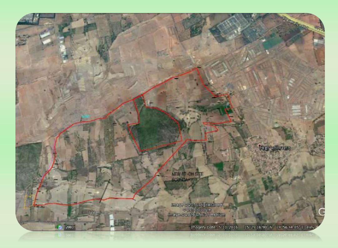
Google Earth photo of the site for the permanent site of IIT Dharwad

About 470 acres of land has been provided by the Karnataka Government for the permanent campus of IIT Dharwad about 2-3 km from existing WALMI campus. Campus development and establishment of infrastructure are being taken up.