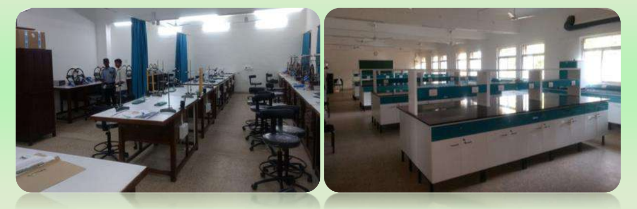
UG Laboratory Facilities (Workshop, Computer lab, Physics Lab, Chemistry Lab)