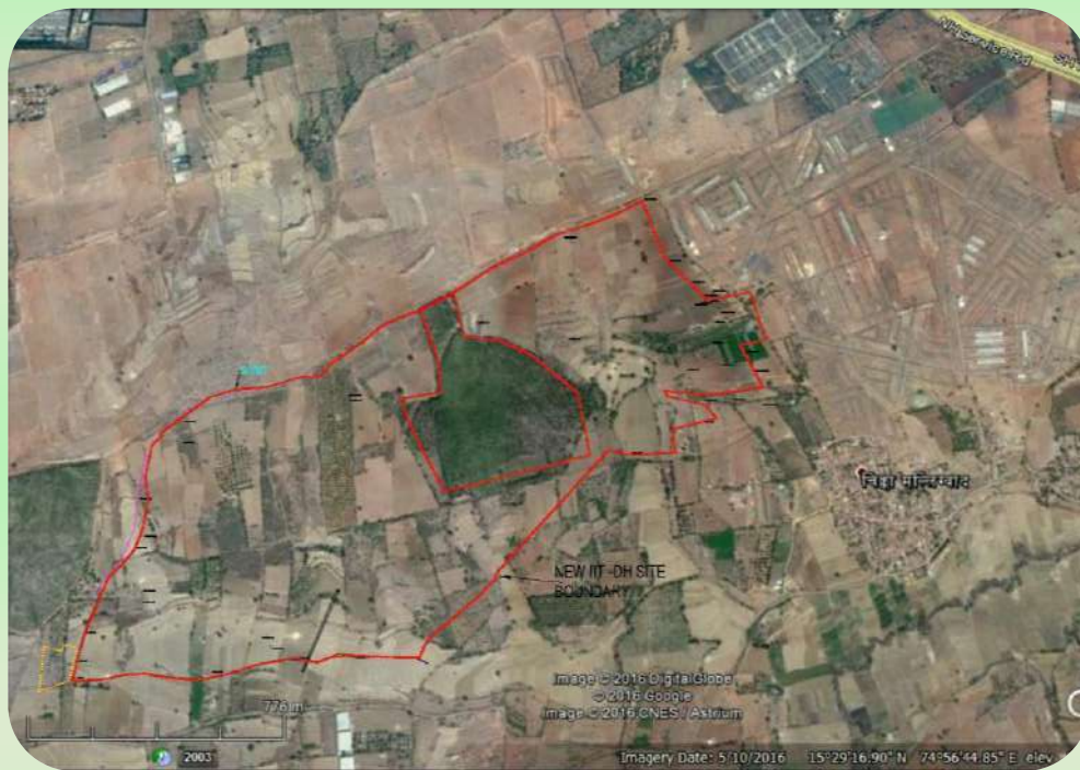
Google Earth photo of the site for the permanent site of IIT Dharwad

About 470 acres of land has been provided by the Karnataka Government for the permanent campus of IIT Dharwad about 2-3 km from existing WALMI campus. Campus development and establishment of infrastructure are being taken up.