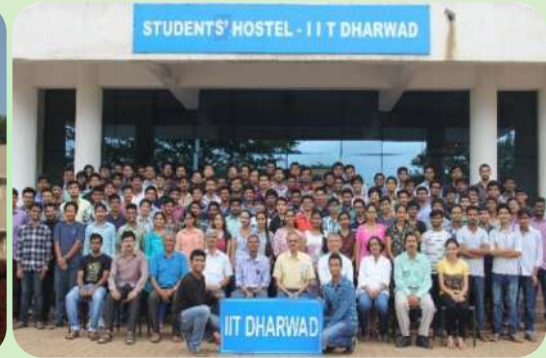
Indian Institute of Technology Dharwad Campus