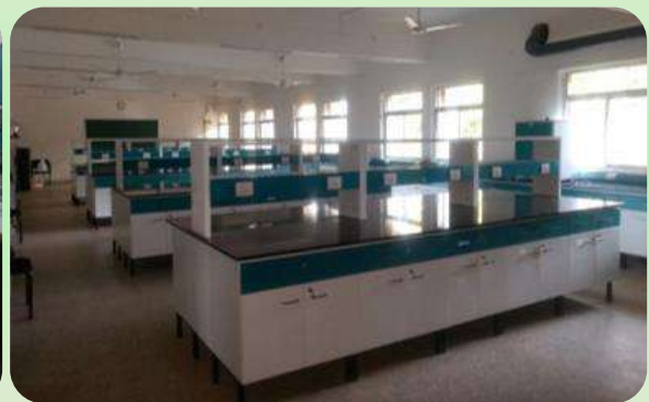
UG Laboratory Facilities (Workshop, Computer lab, Physics Lab, Chemistry Lab)